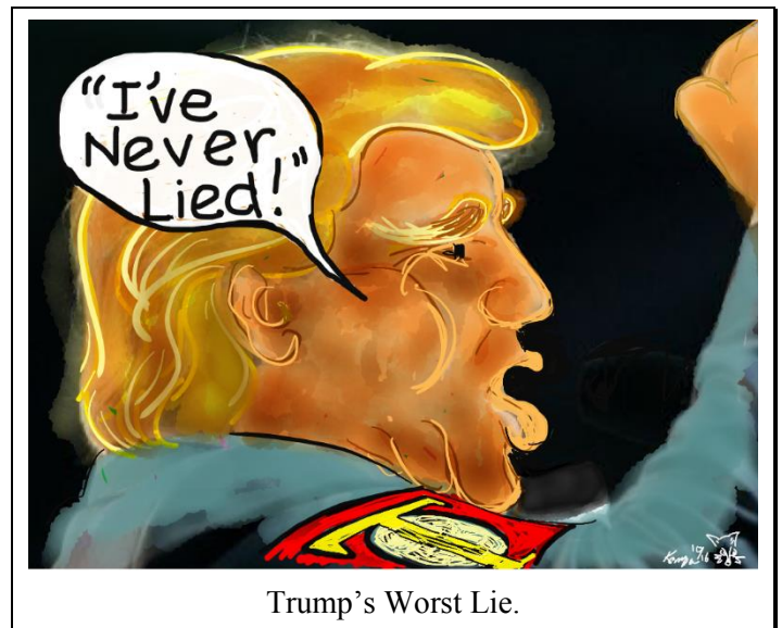
Trump's Worst Lie.